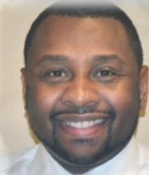
Descendant of Crispus Attucks