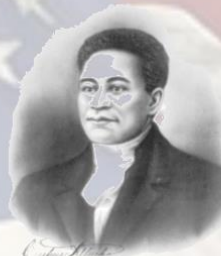
1st Casualty of Revolutionary War

Come join us to celebrate 4 Black Revolutionary War Heroes that are buried here in Massachusetts